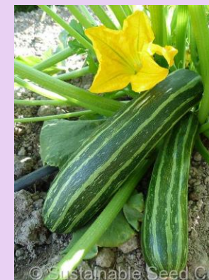
HEIGHTS- GRASS FED BEEF,