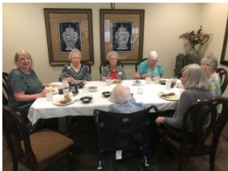
Treating our friends from Parsons House Frisco to a delicious meal in our private dining room.