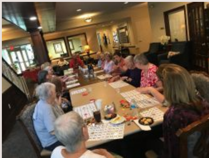
Residents enjoying the casino Family night!